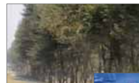
Fig. 4 Afforestation along Canals