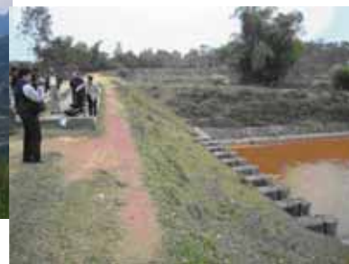
Tac Huong Irrigation Scheme (On 8th Dec)