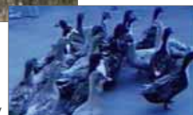
Fig. 5 Duck culture by beneficiary