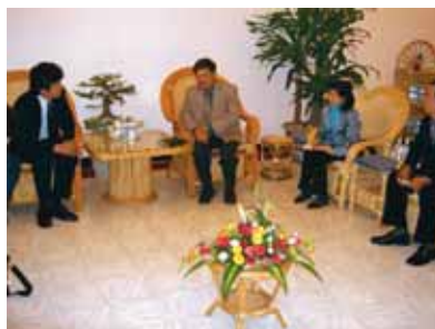
Courtesy Call for Vice Minister (on 5th December)