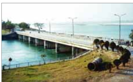
Fig. 2 Canal Head Regulator