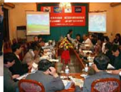
Scenery of Meeting