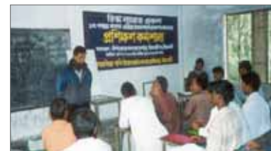
Fig. 3 Beneficiary Training