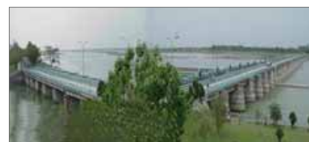
Fig. 1 Teesta Barrage

The Teesta Barrage is constructed over the Teesta River to raise the water level and thus, to feed the main canal taking off from its upstream side. The Barrage itself is situated at Doani, Lalmonirhat completed in August 1990. The Barrage is 615 m long fitted with 44 opening (vent) with radial gates. Width of each vent is 12.19 m. The design discharge capacity of the Barrage is