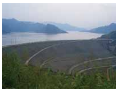
Hoa Binh Dam (On 7th Dec)