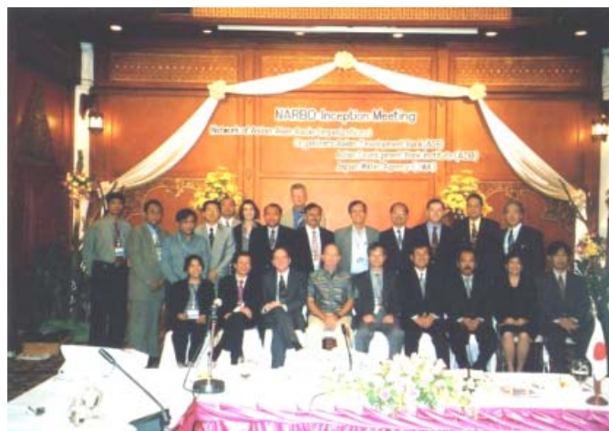
Inception Meeting in Chiang Mai

An Inception meeting was held in Chiang Mai, Thailand on November 20, 2003 to lay the groundwork for the establishment of NARBO, which will be officially announced at its first General Meeting scheduled on February 24-26, 2004 in Batu, Indonesia.