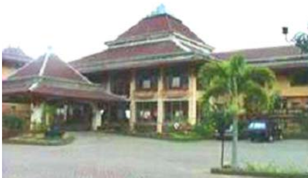
Venue of NARBO General Meeting, Royal Orchids Garden Hotel in Malang, Indonesia