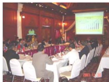
Inception Meeting in Chiang Mai