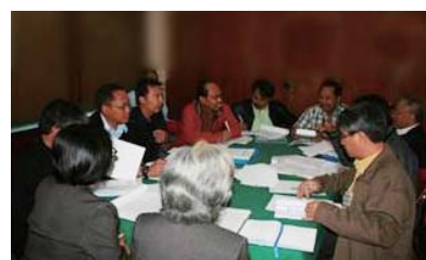
Workshop on Performance Benchmarking

To stimulate performance improvement of RBOs and allow practical exchange of experience, Performance Benchmarking is carried out among NARBO members. On-line database and web interface for a NARBO Benchmarking Service are being developed.