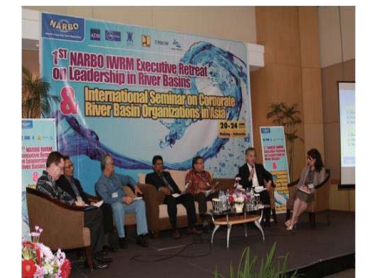
1st NARBO IWRM Executive Retreat on Leadership in River Basins (Indonesia)

NARBO conducted international conferences such as '1st NARBO IWRM Executive Retreat on Leadership in River Basins' and 'NARBO International Seminar on Corporate RBOs in Asia' in 2011. Intensive discussions were made among high level officials, RBO leaders and champions. Basically, we agreed that i) Importance of good leadership and the value of dialogue and networking; and ii) Necessity of better documentation of experiences of basin-level IWRM in Asia and working together through NARBO in sharing knowledge and good practices.