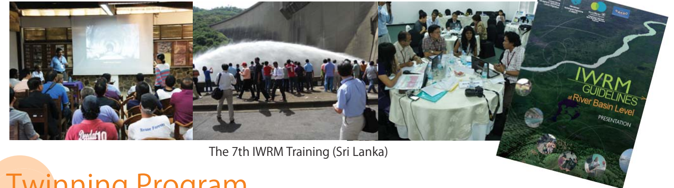
The 7th IWRM Training (Sri Lanka)

Training courses are organized for capacity development of RBOs in implementing IWRM among member organizations. Since 5th Training in Viet Nam, NARBO has been using "IWRM Guidelines at River Basin Levels" which was launched by UNESCO in 2009 as a main training textbook. Outcomes of the training have been contributed to establish IWRM plans in their river basins.