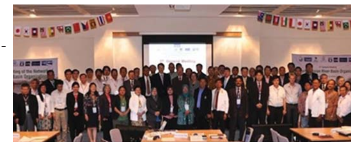
The 5th General Meeting (Thailand)

NARBO General Meeting is held in every two years, and review the past two years activities and approve new action program and Management Team. Workshop and Study Visit to look for solutions on specific topics are also held. It is also an important opportunity to share knowledge and experience of each member organization and make the best use of the consultation to Knowledge Partners.