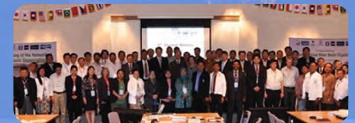
The 5th General Meeting (Thailand)

NARBO General Meeting is held in every two years, and reviews the past two years activities and approves new action program and Management Team. Workshop and Study Visit to look for solutions on specific topics are also held. It is also an important opportunity to share knowledge and experience of each member organization and make the best use of the consultation to Knowledge Partners.