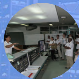
Study Visit in Thematic Workshop

Thematic Workshops are organized in response to member's needs for NARBO activities, focusing on the specific themes. We have conducted workshops on Water Allocation and Water Rights, Sustainable Management for Water Resources Infrastructures and Water-Related Disaster and its Management. Action programs which were summarized at each workshop as a result of the workshop were proposed to each organization, and it was incorporated into their activities.