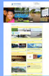
Web Site http://www.narbo.jp/