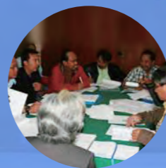
Workshop on Performance Benchmarking

To stimulate performance improvement of RBOs and allow practical exchange of experience, Performance Benchmarking is carried out among NARBO members using on-line database and web interface for a NARBO Benchmarking Service are being developed.