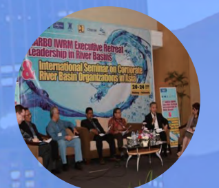
1st NARBO IWRM Executive Retreat on Leadership in River Basins (Indonesia)

NARBO conducted international conferences such as '1st NARBO IWRM Executive Retreat on Leadership in River Basins' and 'NARBO International Seminar on Corporate RBOs in Asia' in 2011. Intensive discussions were made among high level officials, RBO leaders and water champions. Basically, we agreed that i) Importance of good leadership and the value of dialogue and networking; and ii) Necessity of better documentation of experiences of basin-level IWRM in Asia and working together through NARBO in sharing knowledge and good practices.