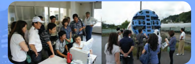
Field trip in Twinning Program (Japan)

NARBO's Twinning Program is a program to exchange staff among members to exchange information and experiences among members for improving water resources management. This program is very useful in exchanging technology and sharing practical solution on IWRM. Twinning Program is one of the features of NARBO activities.