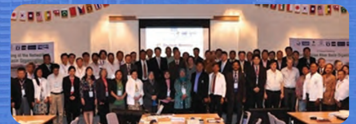
The 5th General Meeting (Thailand)

NARBO General Meeting is held in every two years, and reviews the past two years activities and approves new action program and Management Team. Workshop and Study Visit to look for solutions on specific topics are also held. It is also an important opportunity to share knowledge and experience of each member organization and make the best use of the consultation to Knowledge Partners.