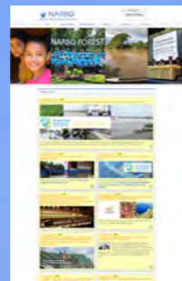
Web Site http://www.narbo.jp/