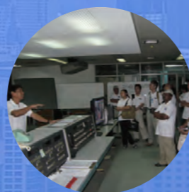
Study visit in Thematic Workshop

Thematic Workshops are organized in response to member's needs for NARBO activities, focusing on the specific themes. We have conducted workshops on Water Allocation and Water Rights, Sustainable Management for Water Resources Infrastructures and Water-Related Disaster and its Management. Action programs which were summarized at each workshop as a result of the workshop were proposed to each organization, and it was incorporated into their activities.