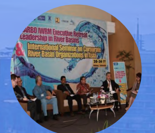
1st NARBO IWRM Executive Retreat on Leadership in River Basins (Indonesia)

NARBO conducted international conferences such as '1st NARBO IWRM Executive Retreat on Leadership in River Basins' and 'NARBO International Seminar on Corporate RBOs in Asia' in 2011. Intensive discussions were made among high level officials, RBO leaders and water champions. Basically, we agreed that i) Importance of good leadership and the value of dialogue and networking; and ii) Necessity of better documentation of experiences of basin-level IWRM in Asia and working together through NARBO in sharing knowledge and good practices.