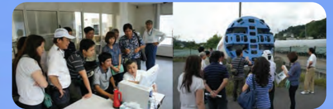
Field trip in Twinning Program (Japan)

NARBO's Twinning Program is a program to exchange staff among members to exchange information and experiences among members for improving water resources management. This program is very useful in exchanging technology and sharing practical solution on IWRM. Twinning Program is one of the features of NARBO activities.